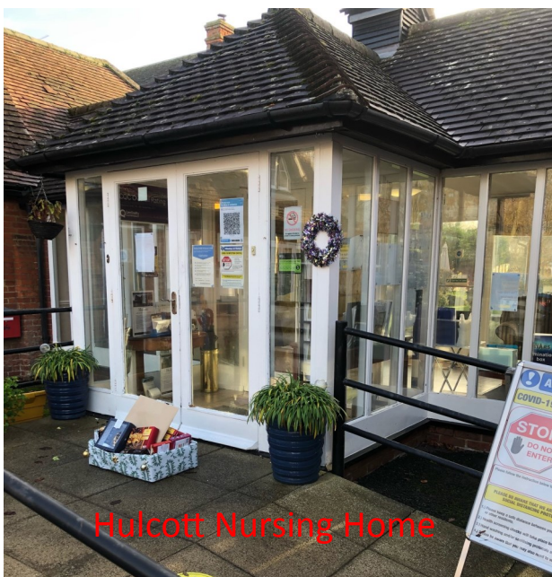
Hulcott Nursing Home